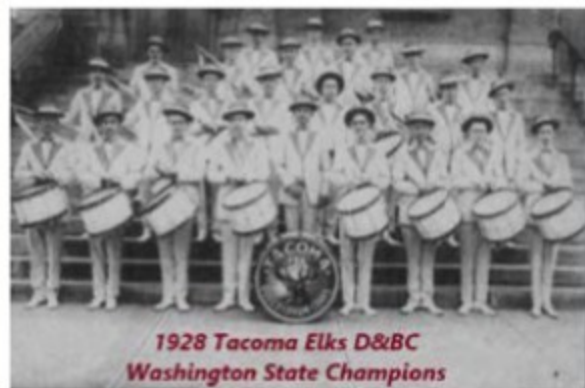
1928 Tacoma Elks D&BC Washington State Champions