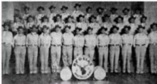
1958 Great Falls Elks, MT Elks National Champions