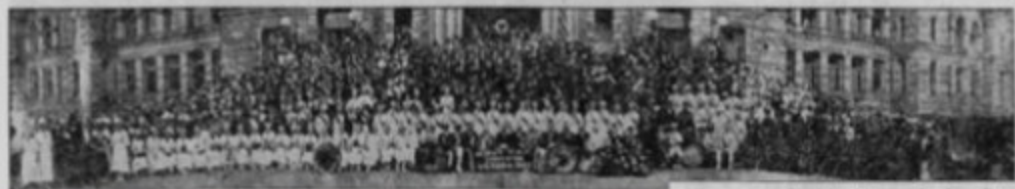
Seattle Moose Lodge Drum Corps

UNIQUE PANORAMIC PICTURE OF EIGHTH ANNUAL CONVENTION OF NORTHWEST MOOSE ASSOCIATION