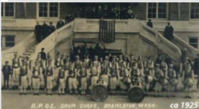
D. P. G. L. DRUM CORPS, BREHERTON, WASH. ca 1925