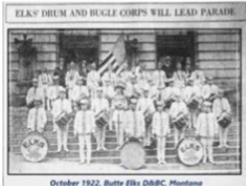
October 1922, Butte Elks D&BC, Montana