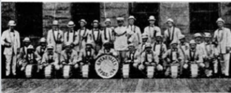
August 1915, Great Falls Elks (Montana)

The Elks' first drum corps competition was held at their 1904 National Convention in Cincinnati, OH. The last Elks national DC championship was in 1958 at New York where the Great Falls, MT, Lodge were champions for the final time. It is unknown how many Elks drum corps existed throughout the states. In the Northwest Elks Association, there were at least 21 drum corps that we know of between 1905 and 1978.