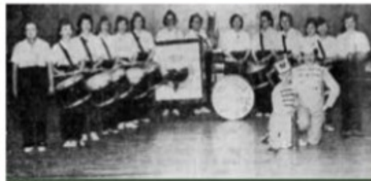
1961 Merrill All-Girl Elks D&BC, OR