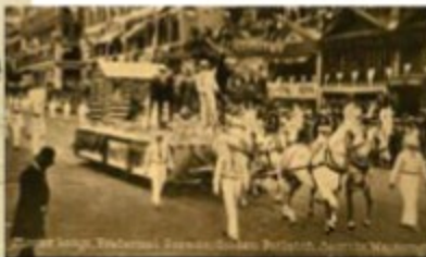
Seattle Moose Lodge ca 1910 - 1920