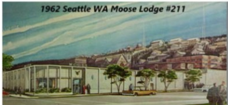
1962 Seattle WA Moose Lodge #211

The Billings (MT) Moose had a Drum Corps for 25-years Between 1927 and 1975