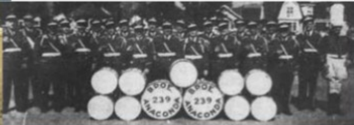
1958 Anaconda Elks D&BC, MT