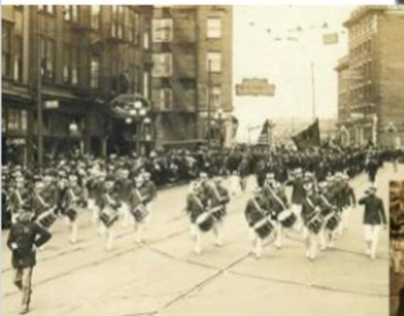
Seattle Moose DC May 30, 1917