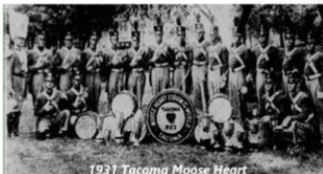
1931 Tacoma Moose Heart