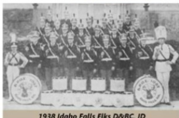
1938 Idaho Falls Elks D&BC, ID