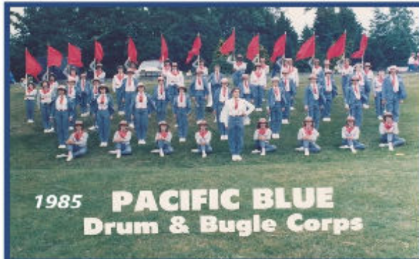
1985 PACIFIC BLUE Drum & Bugle Corps

anywhere outside of Washington / Oregon was made possible with drum corps. Drum corps expanded our horizons; what a life-changing experience for all of us.