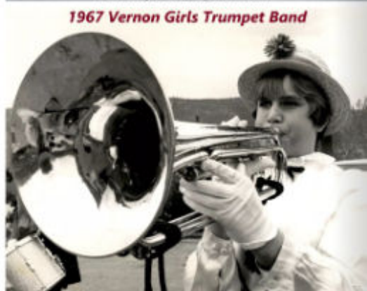
1967 Vernon Girls Trumpet Band