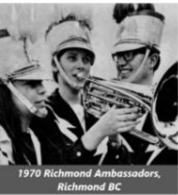
1970 Richmond Ambassadors, Richmond BC

In 1963, the first Western Canadian junior drum corps was formed; the Molson's Klondike D&BC (Edmonton ALB), aka the Edmonton Eskimo Wink Strutters Marching Band. In 1969 they became Edmonton Strutters. The corps went through five name changes before ending up as the Strutters again for the