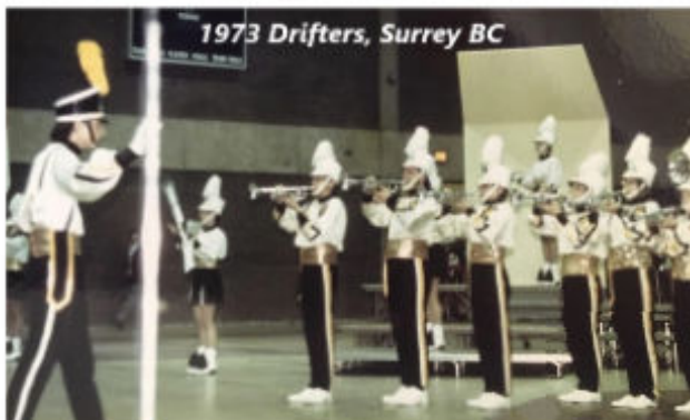
1973 Drifters, Surrey BC