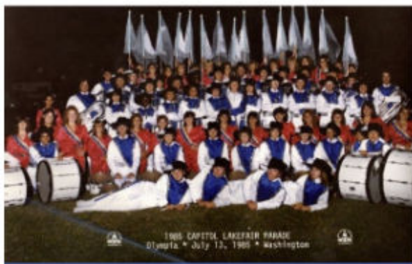
1985 Pacificaires, Surrey BC

Long live drum corps! -- ©Pacific Northwest Drum Corps.com 2025. ■