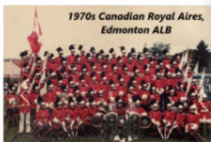
1970s Canadian Royal Aires, Edmonton ALB