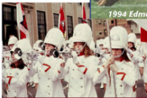
1970's Alberta Girls, Edmonton ALB