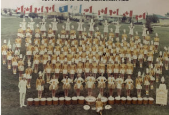
1971 Alberta Girls, Edmonton ALB

final time in 2005. After the Strutters, there were another five drum corps created between 1967 and 1972. Two of those five were called "bugle bands."