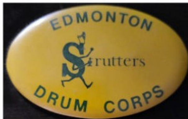
Pacific Blue, Surrey BC (left)