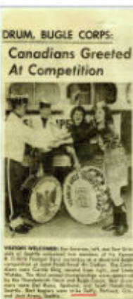
DRUM, BUGLE CORPS: Canadians Greeted At Competition