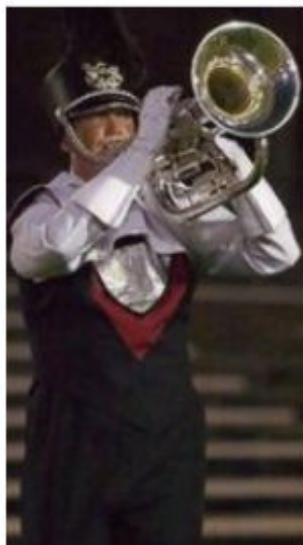
2004 Fusion Calgary, ALB (above)