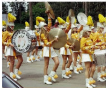
ca1972 Alberta Girls D&BB

We went to Calgary and Edmonton on that tour, passing by Bears Paw and Red Deer