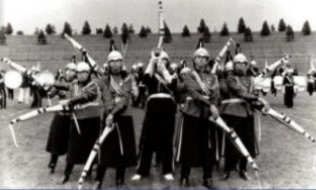
1st Canadian Regiment, Edmonton ALB