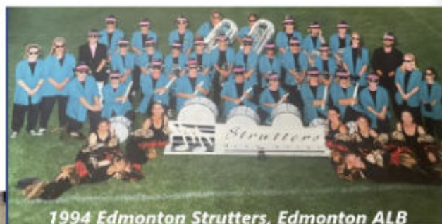
1994 Edmonton Strutters, Edmonton ALB