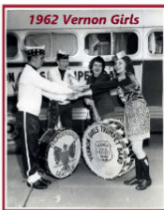
1962 Vernon Girls