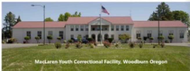
MacLaren Youth Correctional Facility, Woodburn Oregon

Not your typical drum corps, but part of Pacific Northwest history. Small potatoes compared to some of the hijinks of that other corps from that era. Still, we hope some of these lads turned their lives around. Drum corps has done just that, for many of us. ■