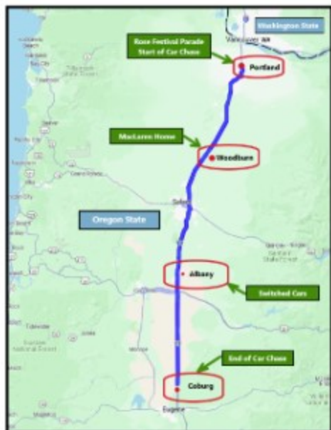
1961 MacLaren Woodburn Oregon