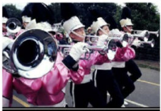
1974 Flamingos - Salem Oregon