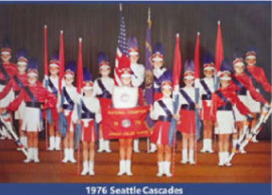
1976 Seattle Cascades American Legion National Champion Color Guard