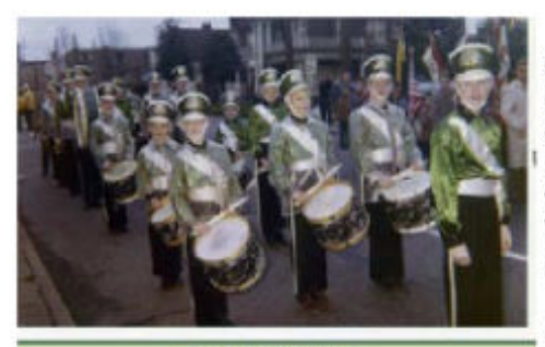
Hearty congratulations to our drum and bugle corps brothers and sisters south of the Columbia! We Washingtonians salute you. Long live drum corps! ■