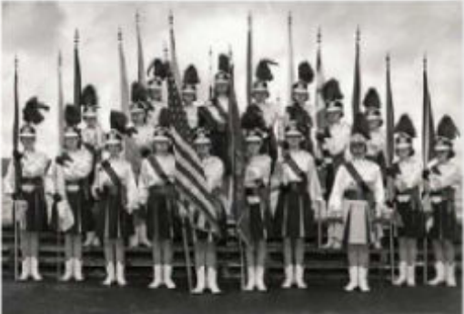
1968 Cascade Cadets (Seattle Cascades) Color Guard