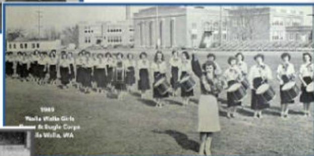
1949 Walla Walla Girls & Bugle Corps Walla, WA

They competed in drum corps contests from