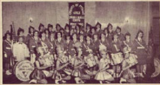
KNIGHTS OF PYTHIAS Girls' Drum & Bugle Corps, Roseburg, Ore.

Another unique drum corps from Canada, the Victoria Thunderbirds Drum Corps (1960 – 1968), was another literal "drum corps." No bugles in this group, just drums and color guard.