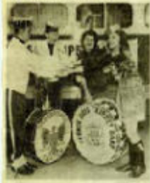
WYOMING DRUM CORPS: Can. drum corps and bugle corps will be warmly welcomed from June 22 to the 26th at the 1968 Drum Corps World Championships in Colorado Springs, Colo. The 1968 Drum Corps World Championships will be held at the Colorado Springs Convention Center, June 22-26, 1968. The 1968 Drum Corps World Championships will be held at the Colorado Springs Convention Center, June 22-26, 1968. The 1968 Drum Corps World Championships will be held at the Colorado Springs Convention Center, June 22-26, 1968.