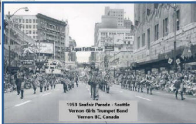
1959 Seafair Parade - Seattle Vernon Girls Trumpet Band Vernon BC, Canada

PNW Canadian corps were a different breed and were sometimes called "drum & bugle Bands." Western Canadian judging