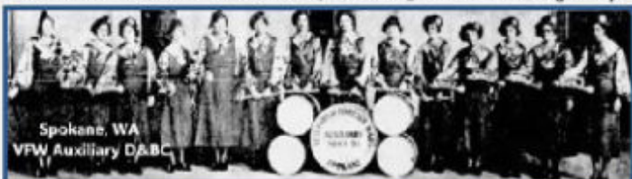
Spokane, WA VFW Auxiliary D&BC

means wife, as in "et ux," which is close to "aux," but never to be confused with "ox" unless you have a death wish.