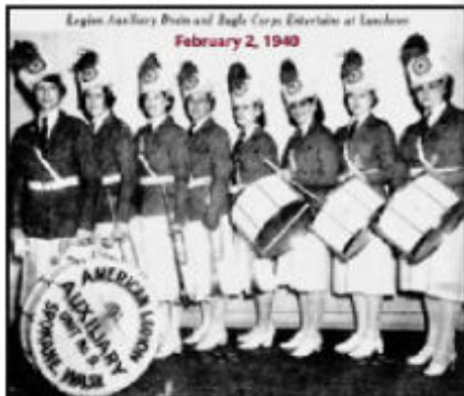
Legion Auxiliary Drum and Bugle Corps Entertainment at Larchmont February 2, 1940

In 1928 the first Girl Scout DC was formed in Eugene, OR. They were acclaimed to be the very first Girl Scout Drum Corps in the U.S. This group was