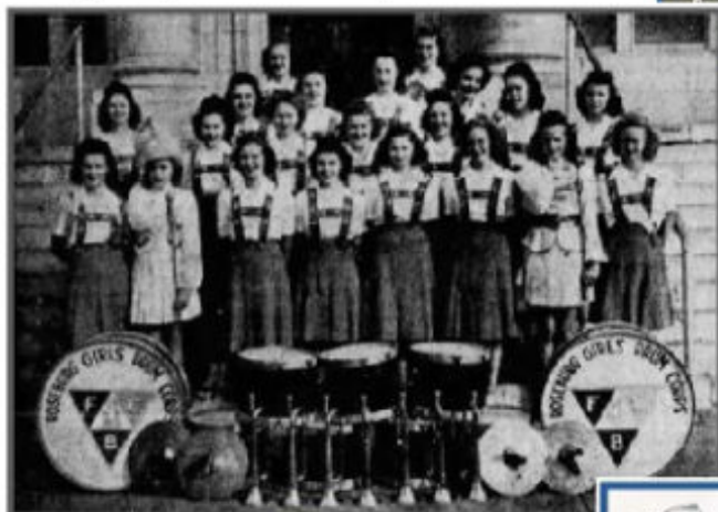
October 10, 1952 Knights of Pythias Drum & Bugle Corps Roseburg, Oregon

1939 through 1941 and were avid community supporters. Our last known documentation on these girls is 1949. [Walla Walla, the city so nice, they named it twice! Sorry, local humor].