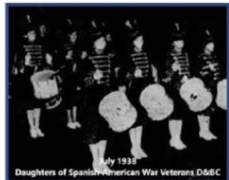
July 1938 Daughters of Spanish-American War Veterans D&BC

Spokane, WA, was a player in all-girl drum corps with both the Spokane American Legion Post #9 Auxiliary D&BC (1927 – 1940) and the Spokane VFW Post #51 Auxiliary D&BC (1934 – unknown).