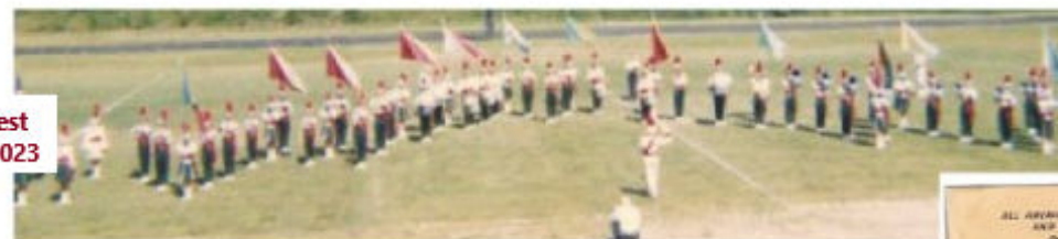
competition. (Above, Seattle Thunderbirds at "Drumkhana," 1969.