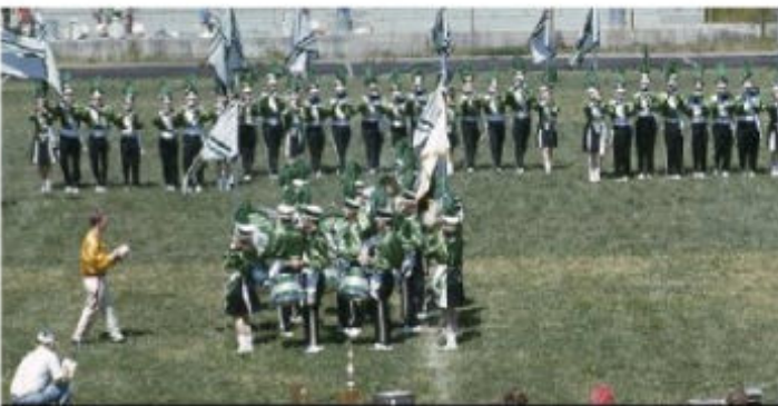
June 4, 1967 - Seattle Shamrocks at Drumkhana in Milwaukie Oregon. The drum judge on the left wearing gold, is a Leatherneck Sr. drum corps member

Sixty years later, the 2023 DCI season runs from June 28 to DCI Finals on August