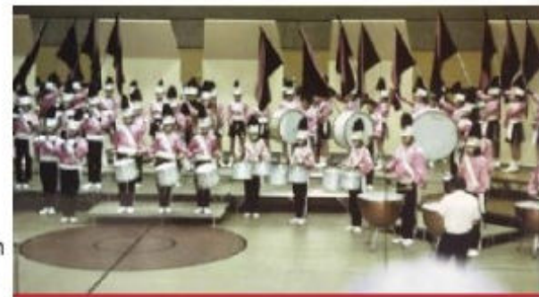
January 20, 1973 Flamingos at the Salem Optirama (their show) "full corps third-diff" segment of the weekend competition