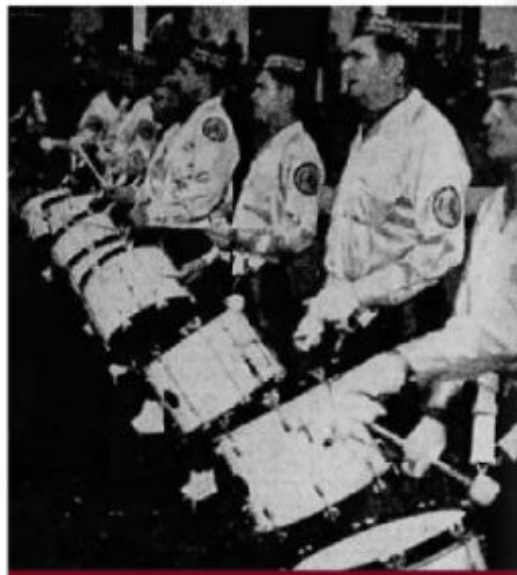
August 9, 1957 - Leathernecks AL Post #169, Portland Oregon

The drum corps show was held at Madison High School in 1964, the