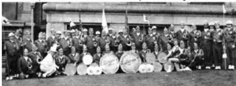
1955 American Legion University Post #11 Sr D&BC; AKA: Seattle Hurricanes Nine-time Washington State Legion Sr. Champions

Long live drum corps, PacificNorthwestDrumCorps.com. ■