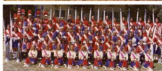
(Top to bottom): March 1966, Lancers quartet; 1970 Hawks snares; 1970 Royal Lancers; 1974 Royal Lancers; left, 2012 Oregon Crusaders.