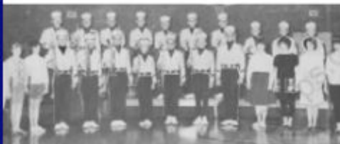
(Top to bottom): 1960 Seaside, OR, state American Legion Championships; 1961 Hawks; 1962 Hawks, welcoming the national president of the American Legion, outside Portland International Airport (PDX); 1964 Lancers