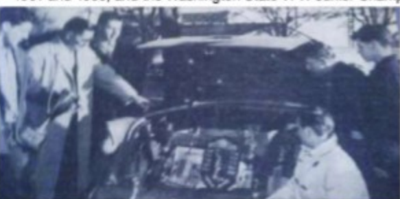
They Are Bugle Corps Winners