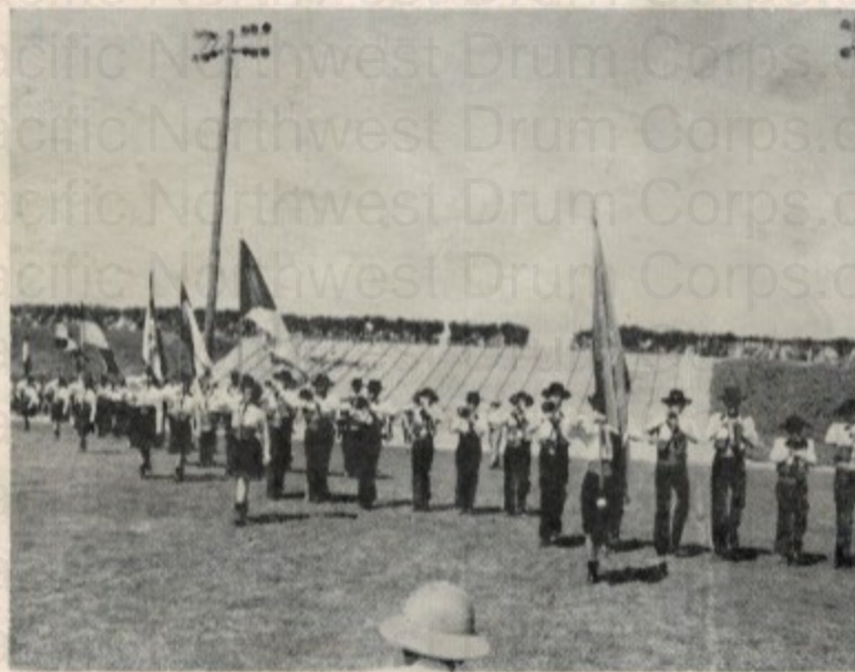
DRUM & BUGLE CORPS COMPETITION