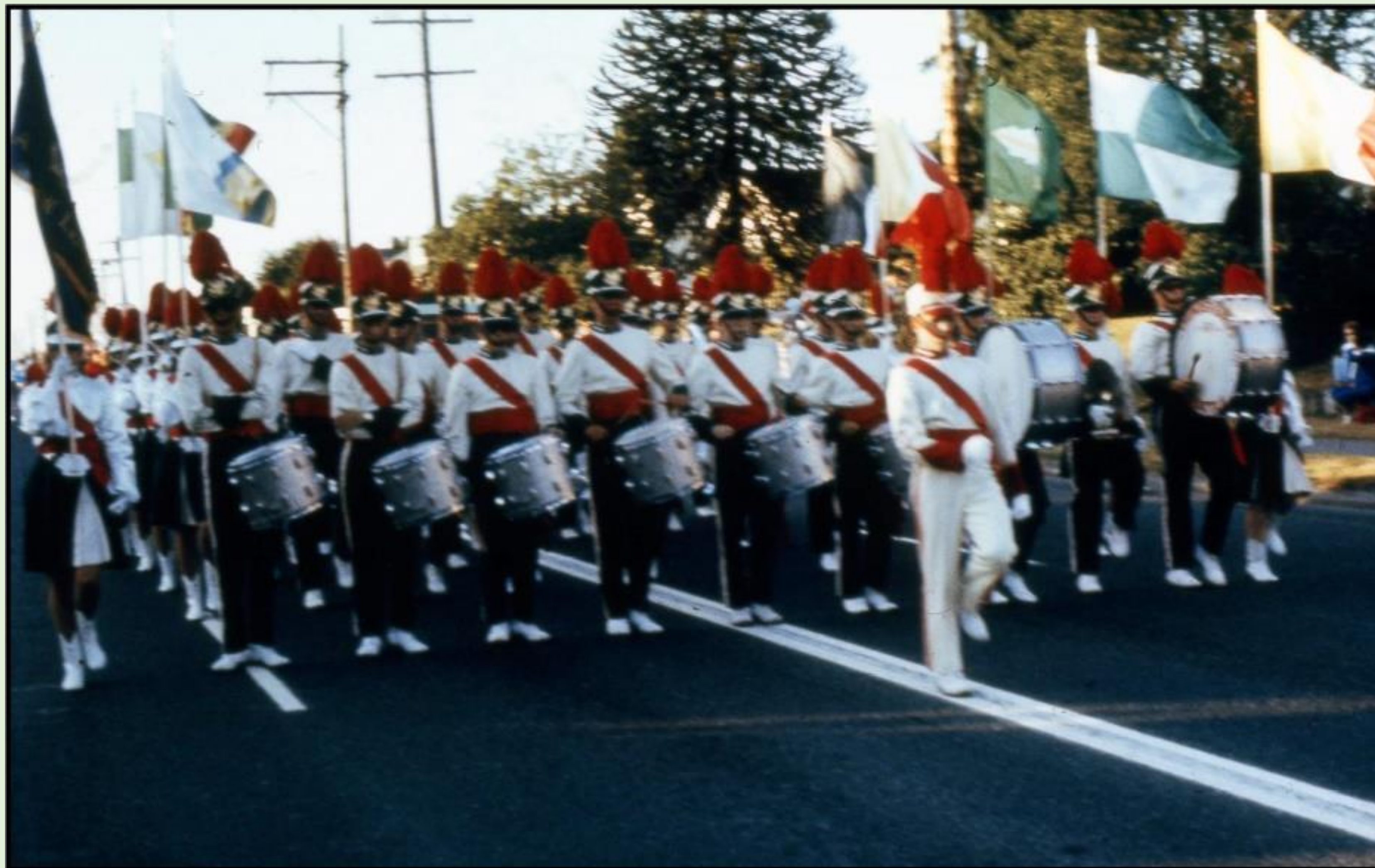
PERCUSSION INSTRUCTOR FOR THE SEATTLE THUNDERBIRDS, 1960 thru 1964 Photo: 1964