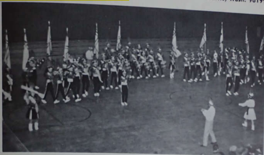
The Shamrocks performing at the Opti-rama.

goal to shoot at for top honors. Taking fourth place was the Hawks of Portland. They lacked the enthusiasm they had last year. We do hope they pick up their spirit and give everybody a run for their money.