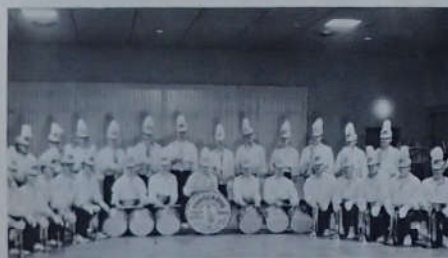
VANGUARD ROCKETS SENIOR DRUM & BUGLE CORPS, BRUCE POST 1146 V.F.W.