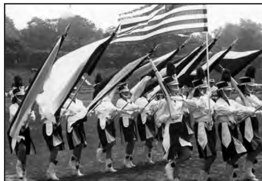
OLC RAMBLERS , Brooklyn, NY (1964).