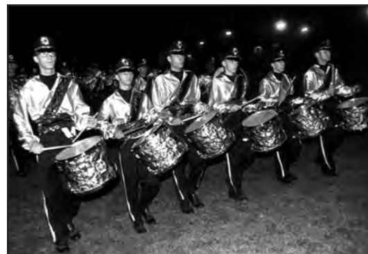
CRITERIONS, Kingston, NY (1964).