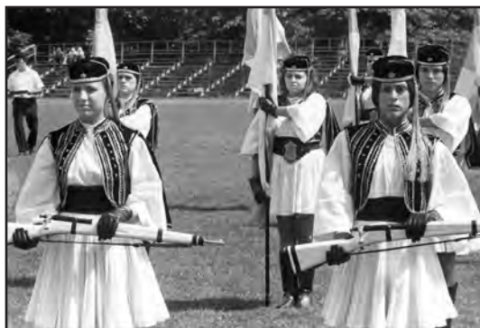
ST. GEORGE OLYMPIANS, Springfield, MA (approx. 1975).