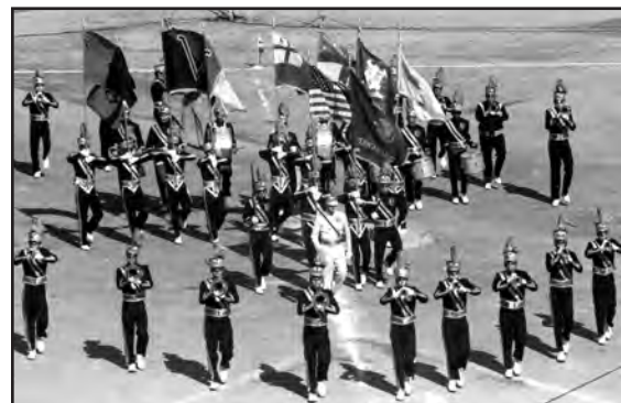
CONNECTICUT VAGABONDS, Torrington, CT (1964).