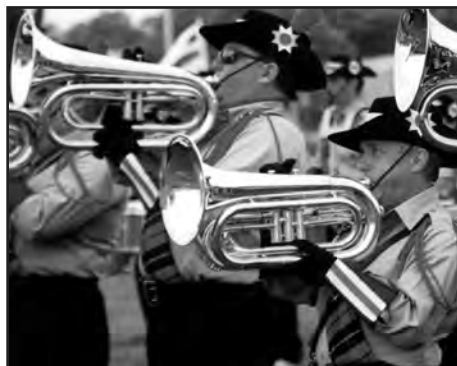
LIGHT BRIGADE ALUMNI , Revere, MA (1998).