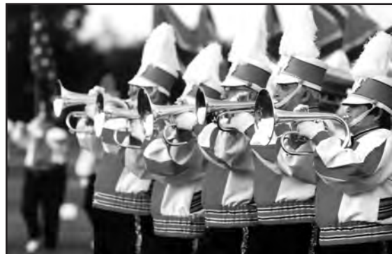
YANKEE REBELS, Baltimore, MD (1998).