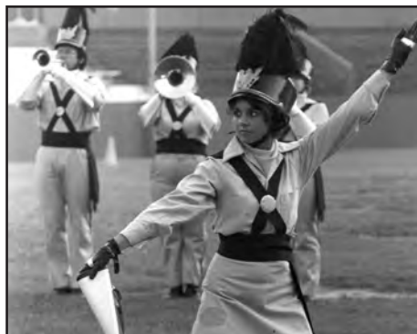
SOUNDS OF CENTRAL NEW YORK, Syracuse, NY (approx. 1980).