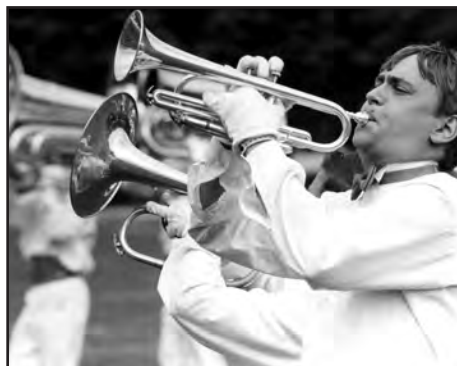
SOUTHERN KNIGHTS , Franklinville, NJ (1994).