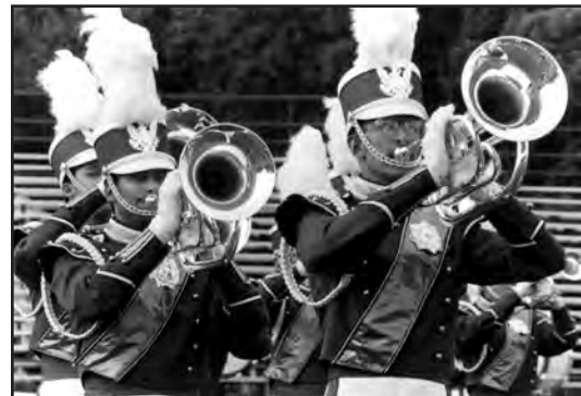
STAR OF INDIANA , Bloomington, IN (1992).