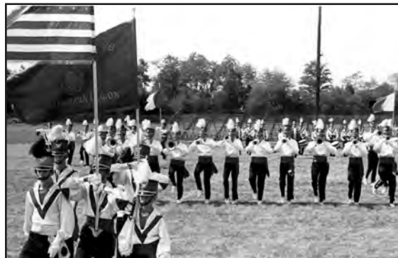
LITTLE DEVILS, Bordentown, NJ (1966).