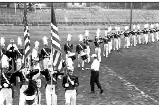
CONNECTICUT YANKEES, Stratford, CT (1964).