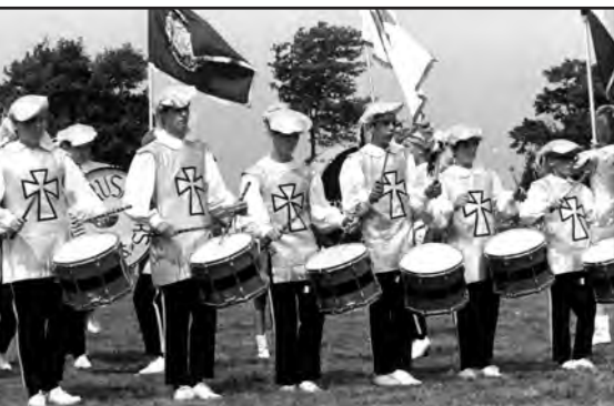
CRUSADERS, Milwaukee, WI (1968).

As if matters weren't challenging enough,