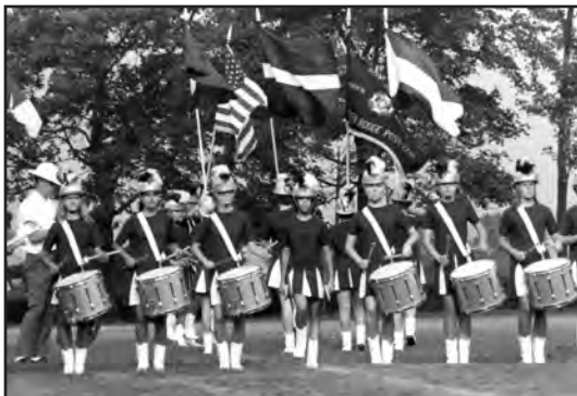
PRAESIDIUM ALL-GIRL, Riverview, MI (1968).