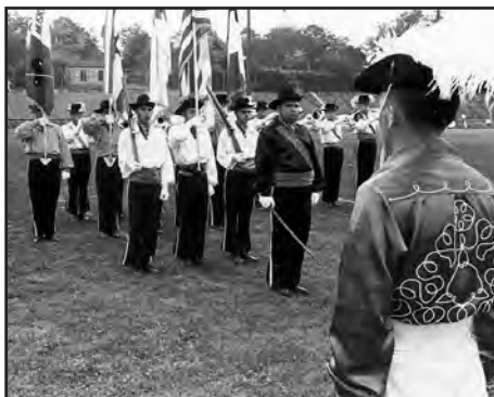
MUSKETEERS, Bristol, RI (1964).