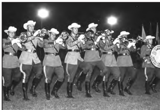
JERSEY SKEETERS/DOREMUS POST, Hackensack, NJ (1964).