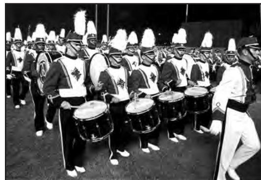
BALLANTINE BREWERS, Newark, NJ (1964).