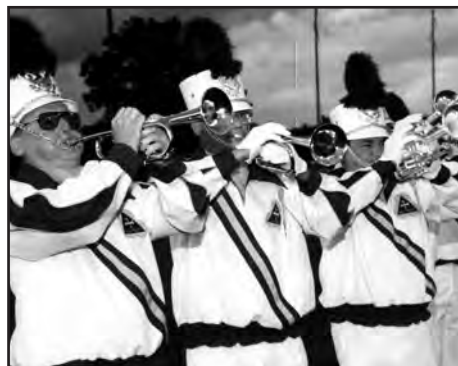
HOLY TRINITY CADETS ALUMNI , Boston, MA (1998).