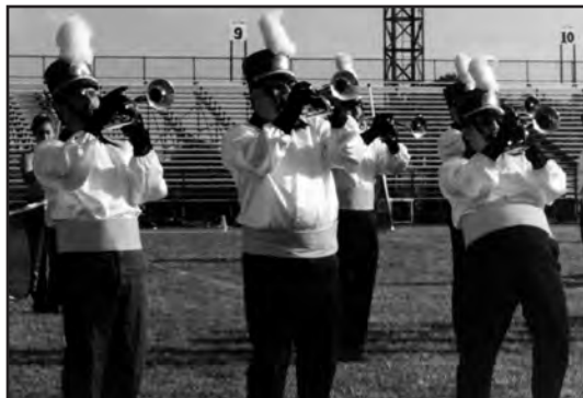
WEST PENN ALUMNI, Pittsburgh, PA (1999).