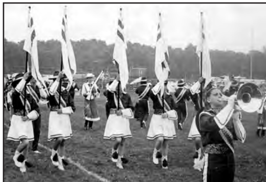
ST. JAMES SAINTS, Centereach, NY (approx. 1975).