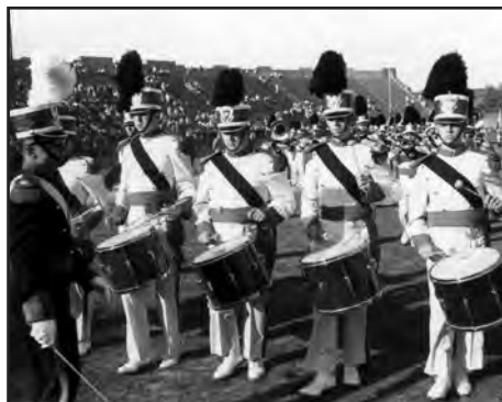
SYRACUSE BRIGADIERS, Syracuse, NY (1964).