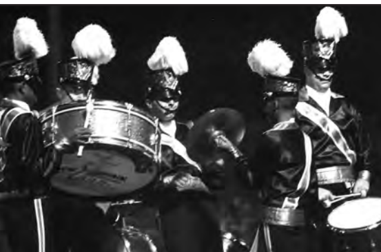
GRENADIERS , New Britain, CT (1964).