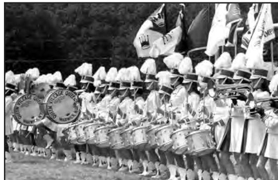
QUEENS VILLAGE QUEENS ALL-GIRL, Warwick, NY (1966).