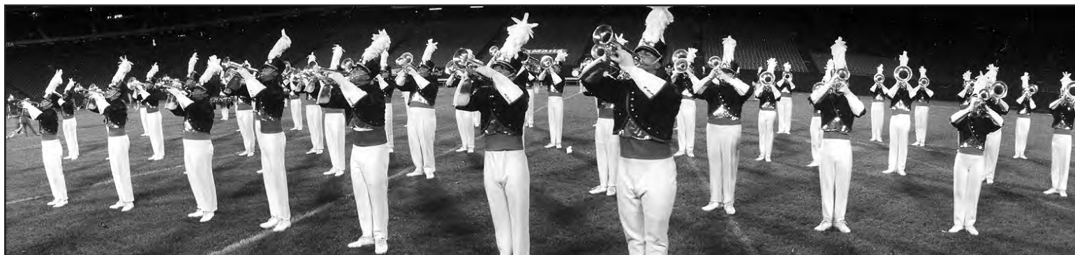
SPIRIT OF ATLANTA , Atlanta, GA (2000).