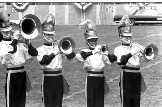
GOLDEN RAYS, Stoughton, MA (1967).