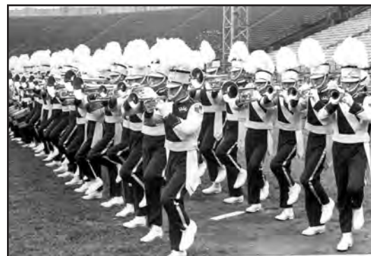
NORWOOD PARK IMPERIALS , Norwood Park, IL (1966).