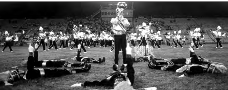
SHORELINERS, Milford, CT (1977).