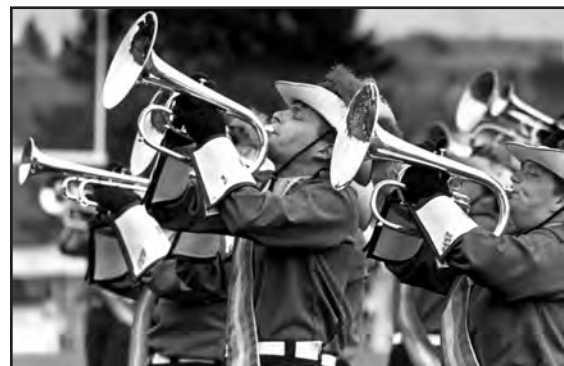
WARRIORS , Lewiston, ME (1987).