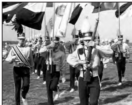
CANADIAN COMMANDERS , Burlington, ONT (1966).