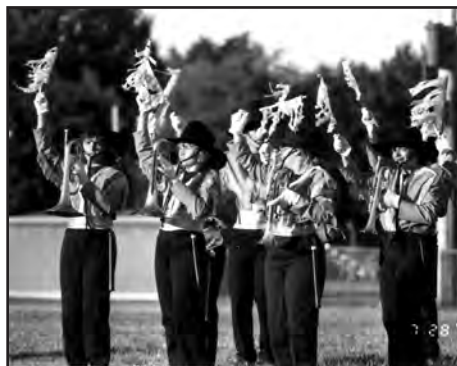
SILVER BULLETS , East Liverpool, NY (1987).