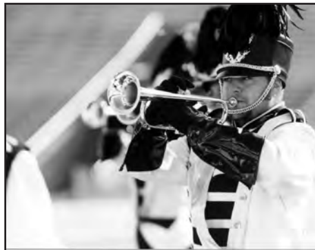
WEST COAST SOUND, San Diego, CA (1999).