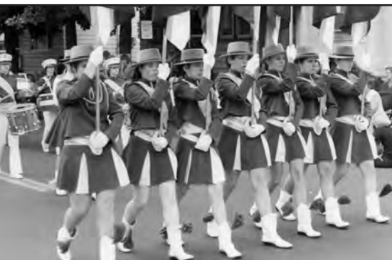
COMMODORES, Floral Park, NY (1979).