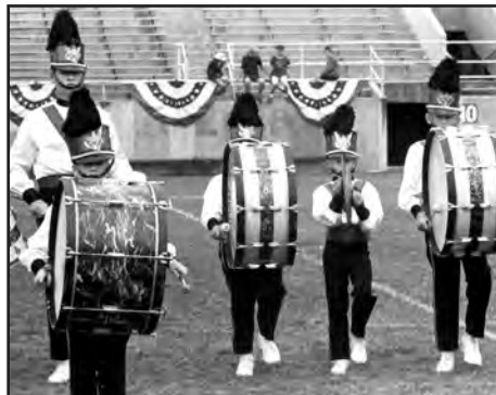
VALIANTS, Hyde Park, MA (1967).