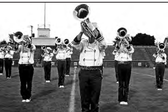
SOUND OF LONG ISLAND , Hicksville, NY (1990).