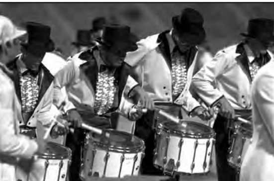
PRIDE OF CINCINNATI , Cincinnati, OH (1988).