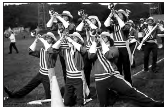
SUNDOWNERS , Eau Claire, WI (approx. 1981).