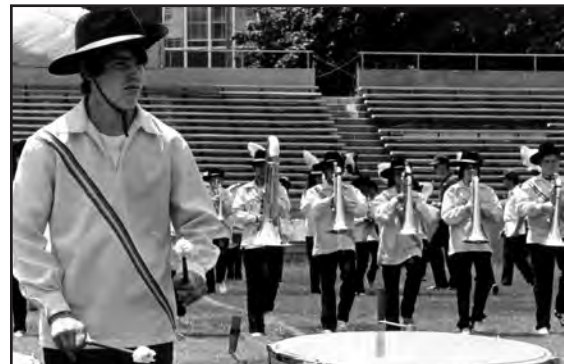
SATELLITES, Leicester, MA (approx. 1977).