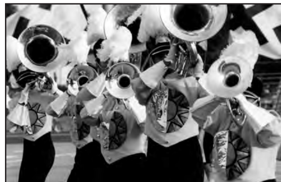
TARHEEL SUN , Cary, NC (1999).