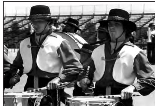
VAQUEROS, Elmhurst, IL (approx. 1980).