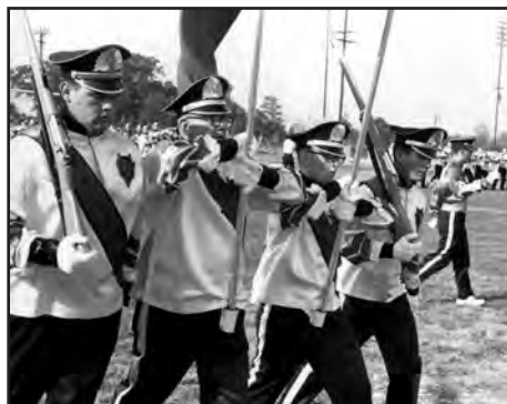
MAUMEE DEMONS, Maumee, OH (1966).