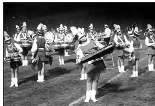
SOCIALITES ALL-GIRL, Saugus, MA (approx. 1976).