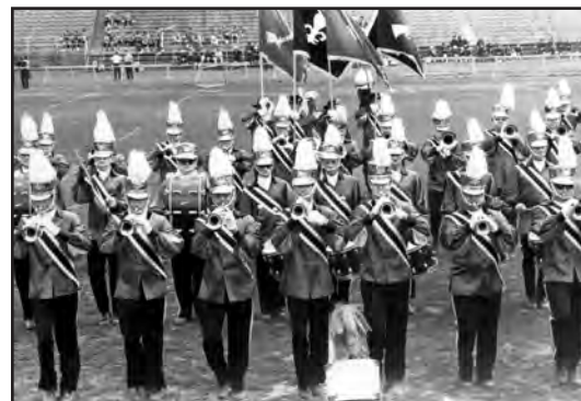
ARCHER-EPLER MUSKETEERS, Upper Darby, PA (1964).