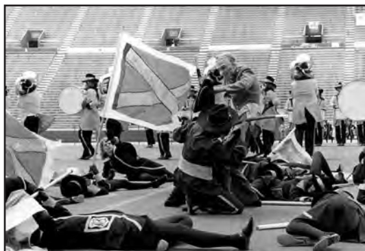
BRIDGEMEN , Bayonne, NJ (1979).