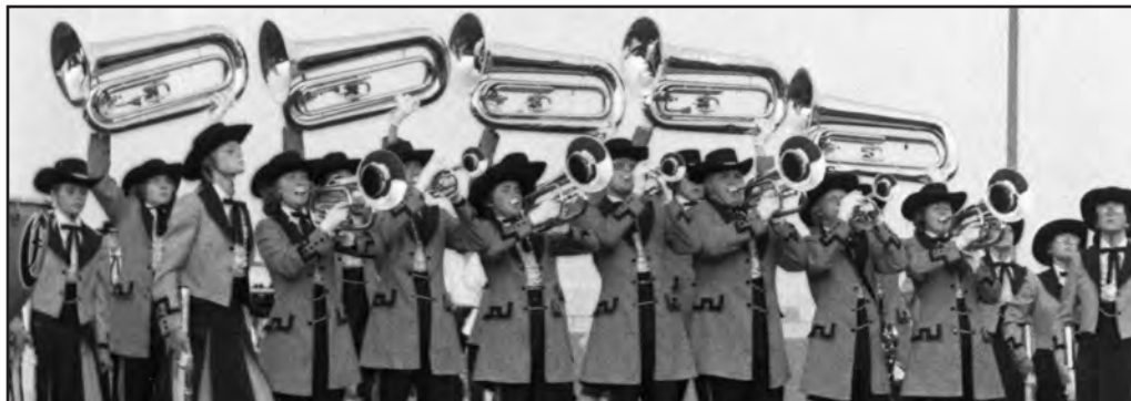
COLTS, Dubuque, IA (1977).

Boston Crusaders, Boston, MA St. Rita's Brassmen, Bronx, NY New York Skyliners, New York City, NY Long Island Sunrisers, Long Island, NY