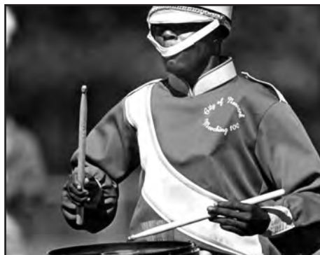
HOLY CHILD MARCHING 100 , Staten Island, NY (1996).