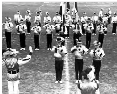
READING BUCCANEERS, Reading, PA (1964).