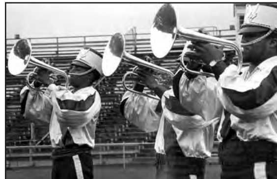
CMCC WARRIORS, New York City, NY (1987).