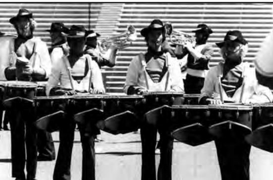
FLORIDA VANGUARD, Miami, FL (approx. 1978).