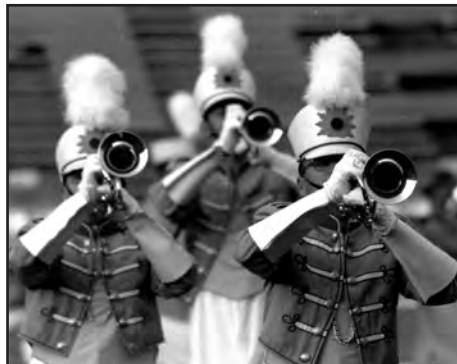
12TH COMMAND , Taylor, MI (1997).