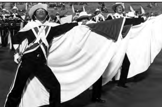
CROSSMEN , West Chester, PA (1978).