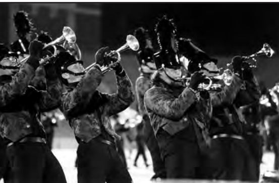
MAGIC OF ORLANDO, Orlando, FL (1998).

• Pitch of the horns: Horn pitch is the most readily available evidence, but knowing what to conclude from it requires familiarity with the tendencies of each corps', horn line over the years and the weather conditions at