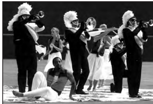
SOUNDWAVE, Butler, PA (1996).