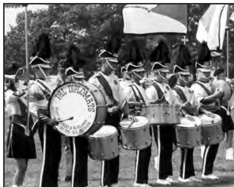
PAL DIPLOMATS, Hollywood-by-the-Sea, FL (1968).