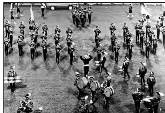
SANTA CLARA VANGUARD, Santa Clara, CA (1969).