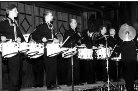
ERIE THUNDERBIRDS ALUMNI, Erie, PA (1998).

27th Lancers, Revere, MA Boston Crusaders, Boston, MA St. Mary's Cardinals, Beverly, MA St. Mary's Majestic Knights, Charlestown, MA