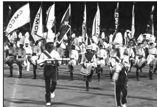
CMCC WARRIORS , New York City, NY (1973).