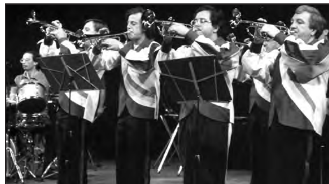
LAMBERTVILLE VOLUNTEERS, Lambertville, NJ (1992).