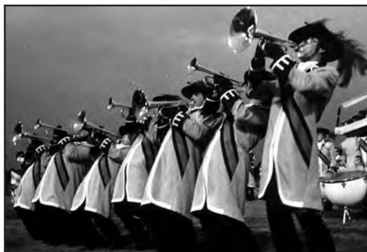
READING BUCCANEERS , Reading, PA (1980).