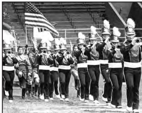
VALLEY AIRS, Northbridge, MA (1976).