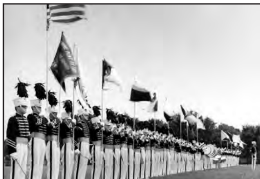
ARGONNE REBELS, Great Bend, KS (1969).

Please note: There were more recordings that fall under this category, but information was unavailable from the sources that were consulted. Fleetwood had a significant side business making small quantities of custom albums for drum and bugle corps and bands, mostly in the New England area. Unfortunately, a fire destroyed all of the master tapes and back stock of the company during the late 1970s.