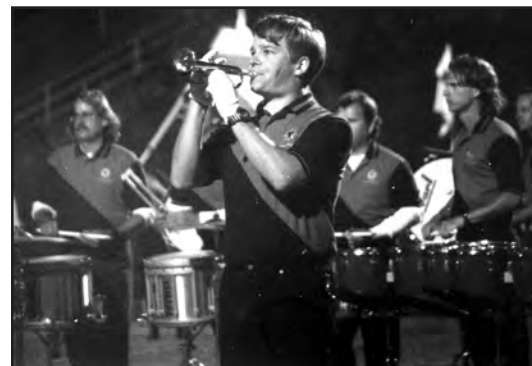
SANTA CLARA VANGUARD ALUMNI, Santa Clara, CA (1997).