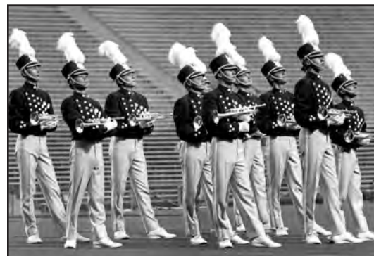
BLUE KNIGHTS , Denver, CO (1991).