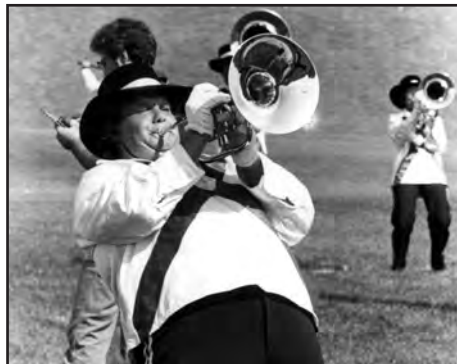
SILVER SPECTRUM , Marshalltown, IA (approx. 1980).