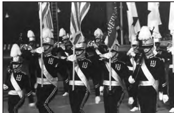
WANDERERS, New Rochelle, NY (1966).