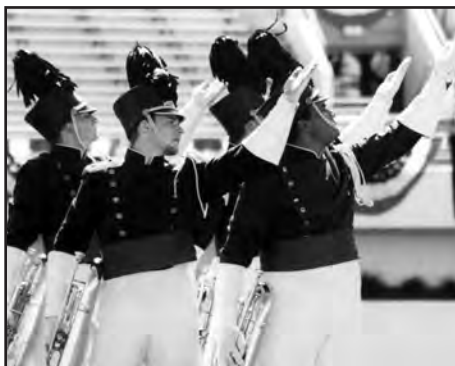
VOLUNTEERS, Knoxville, TN (1998).