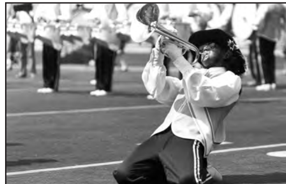
RENAISSANCE , Spokane, WA (approx. 1978).