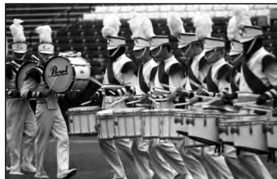
CAROLINA CROWN , Charlotte, NC (1994).