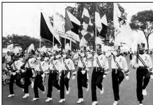
INTERSTATESMEN, Albany, NY (1964).