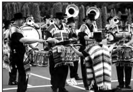
NORTHWEST VENTURE, Seattle, WA (2000).