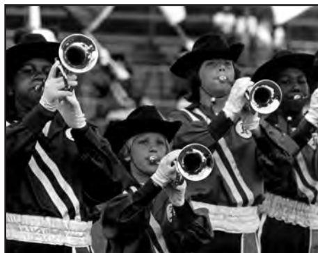
BAYONNE KIDETS, Bayonne, NJ (approx. 1976).