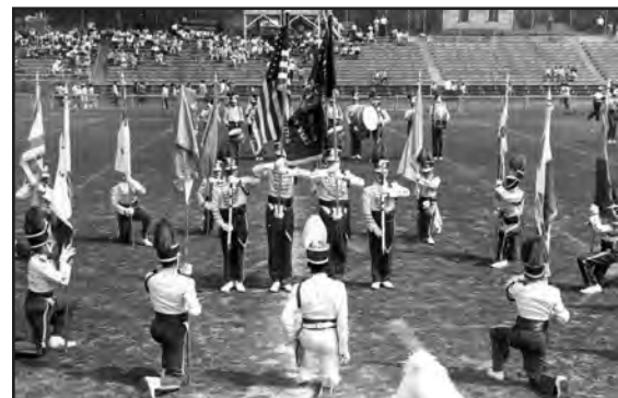
PITTSFIELD CAVALIERS, Pittsfield, MA (1964).