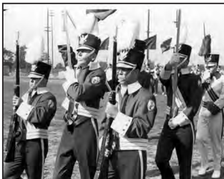
BOYS OF '76, Racine, WI (1966).