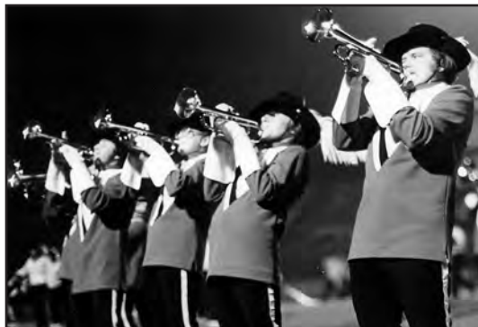
ERIE THUNDERBIRDS, Erie, PA (1978).