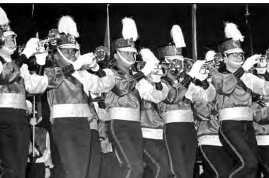
WHALERS, New Bedford, MA (1968).