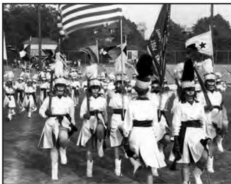
LITTLE FALLS CADETS , Little Falls, NJ (1964).