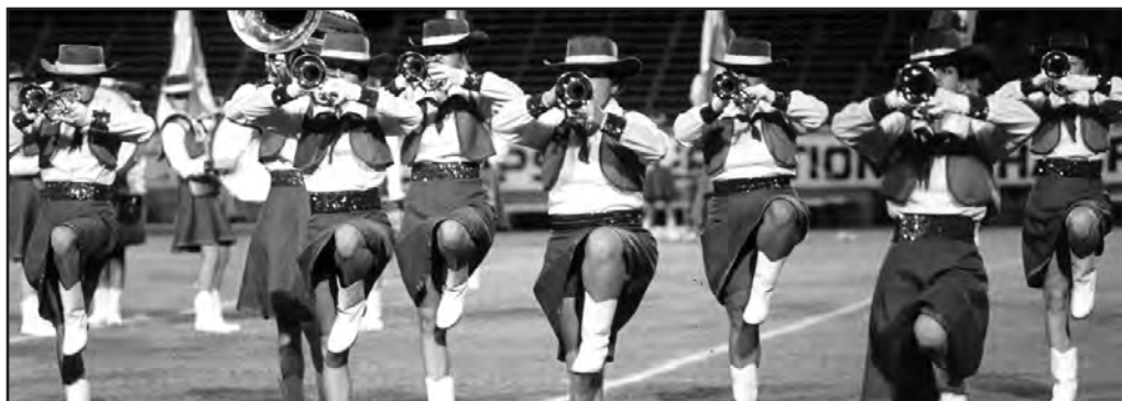
ST. IGNATIUS ALL-GIRL, Hicksville, NY (1981).