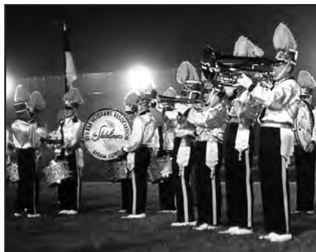
STATELINERS, Byram, CT (1964).