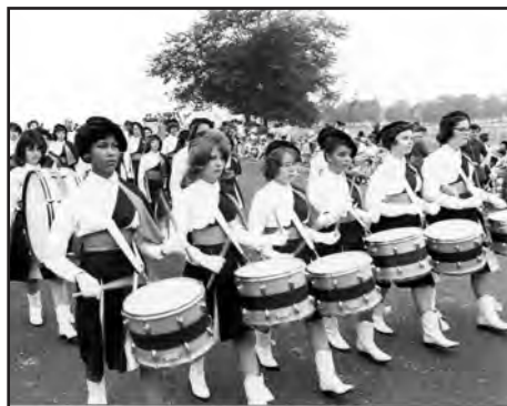
N-D ettes All-Girl, Bridgeport, CT (1964).