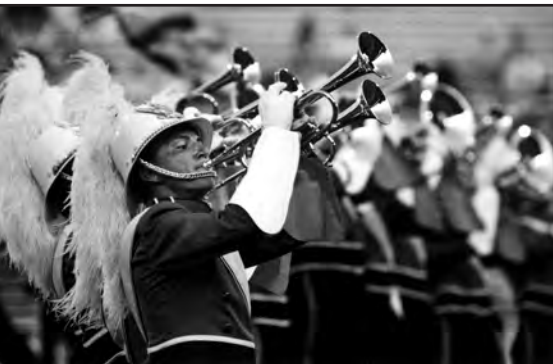
BLUECOATS , Canton, OH (1987).

St. Kevin's Emerald Knights, Dorchester, MA, recorded 8/30/59 at the National Dream in Jersey City, NJ Chicago Cavaliers, Chicago, IL, recorded 5/29/60 in Jersey City, NJ Garfield Cadets, NJ, recorded 5/29/60 in Jersey City, NJ Blessed Sacrament Golden Knights, Newark, NJ, recorded 5/29/60 in Jersey City, NJ