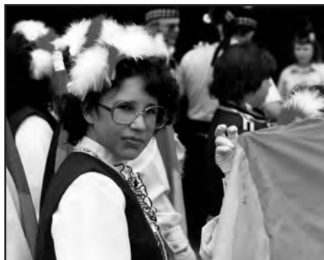
SUBURBANETTES, Hudson, NH (approx. 1980).