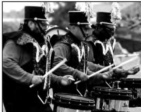
WESTSHOREMEN , Harrisburg, PA (2000).