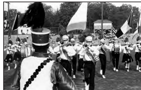
TARGETS, Springfield, MA (1964).