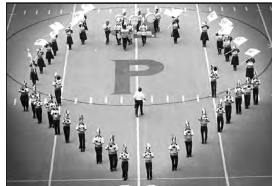
PRINCEMEN , Malden, MA (1981).