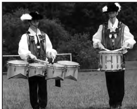
VALLEY PIONEERS, Belchertown, MA (1998).