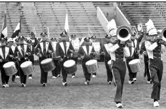
DYNAMIC DUO (Shortsville/Auburn, NY (1967).

Let's delve back into history and recall the