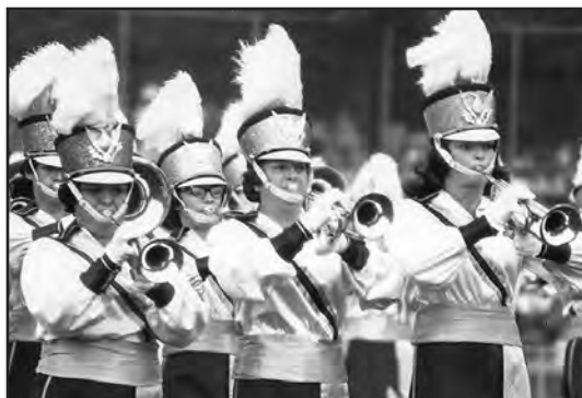
BELLES OF ST. MARY'S ALL-GIRL, Gloucester City, NJ (1964).