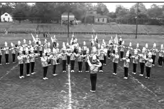
EMMAUS SENTINELS, Emmaus, PA (1964). Photo by Moe Knox.