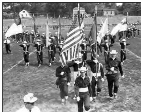
OXFORD EXPLORERS, Oxford, CT (1964).