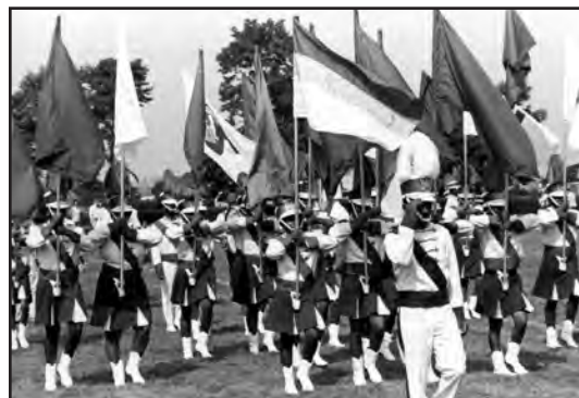
ST. ANDREW'S HORNETS, Chicago, IL (1968).