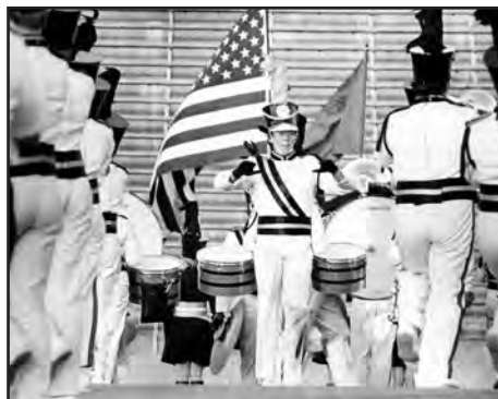
SKY RYDERS , Hutchinson, KS (1975).