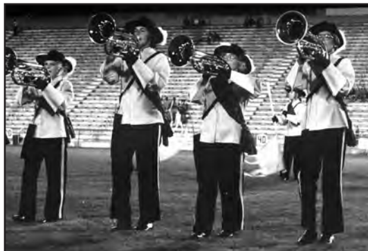
TORNADOES , Fairfield, CT (approx. 1975).