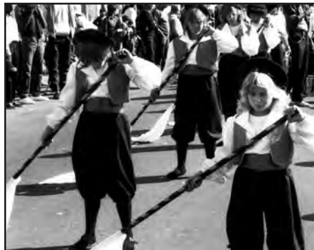
SOUNDATIONS , Belleville, NJ (1982).