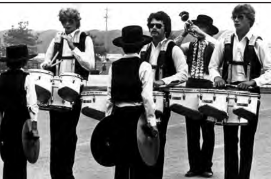
BLACKHAWK VOYAGEURS , Janesville, WI (approx. 1980).