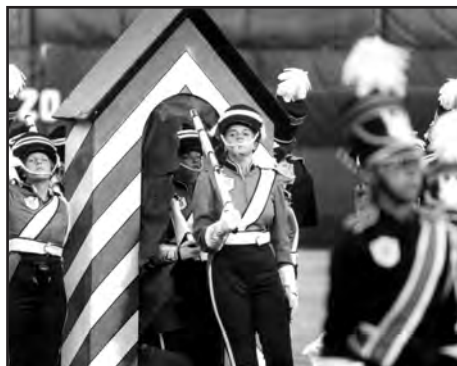
GUARDSMEN, Schaumburg, IL (approx. 1978).