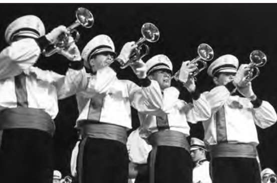
FORT EDWARD VAGABONDS, Fort Edward, NY (1966).