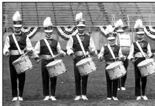
HOLY TRINITY WHITE EAGLES, Lawrence, MA (1967).