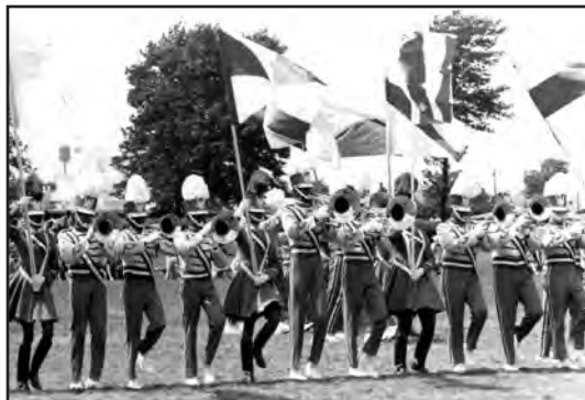
PAGE PARK CADETS, St. Louis, MO (1968).