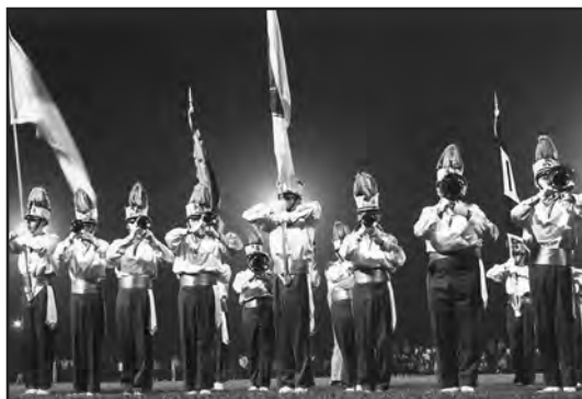
SUNRISERS, Massapequa, NY (1964).