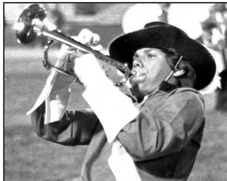
VOLUNTEERS , Troy, NY (approx. 1977).