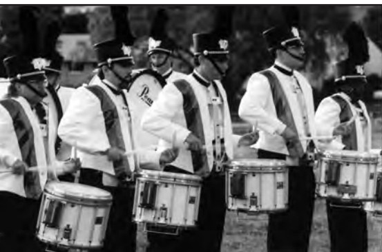
20TH CENTURY LTD., Newburgh, NY (1998).