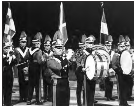
MAGNIFICENT YANKEES, Utica, NY (1966).