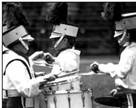
SHARPSHOOTERS, Framingham, MA (approx. 1979).