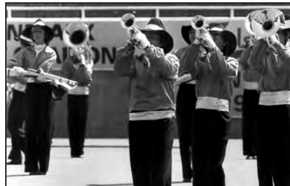
MUSKETEERS , Phoenix, AZ (1988).