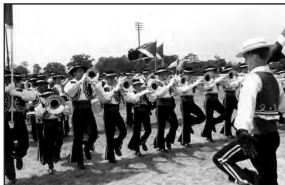
MUCHACHOS, Hawthorne, NJ (1966).