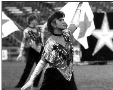
S.T.A.R., Revere, MA (1989).