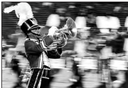
BLUE DEVILS , Concord, CA (1986).