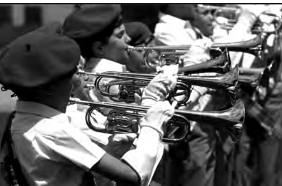
27TH LANCER CADETS, Revere, MA (approx. 1980).