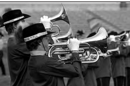
SAGINAIRE EAGLES, Saginaw, MI (1977).