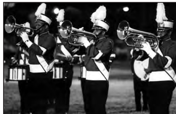
WYNN CENTER TOPPERS ALUMNI, Brooklyn, NY (1998).