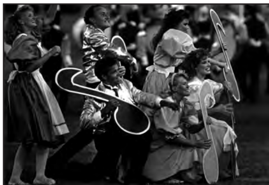
SKY RYDERS, Hutchinson, KS (1988).

Debonnaires All-Girl, Norwood, MA OLPH Ridgemen, Brooklyn, NY Statesmen, Rochester, NY