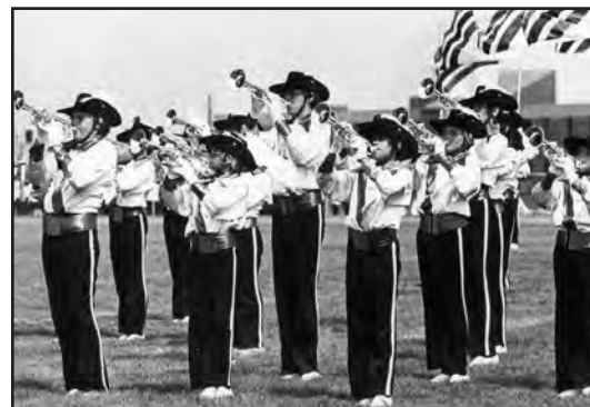
CAVALIER CADETS , Park Ridge, IL (1977).