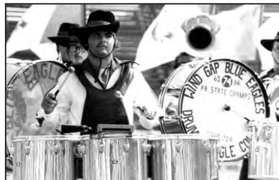
WIND GAP BLUE EAGLES, Wind Gap, PA (approx. 1978).